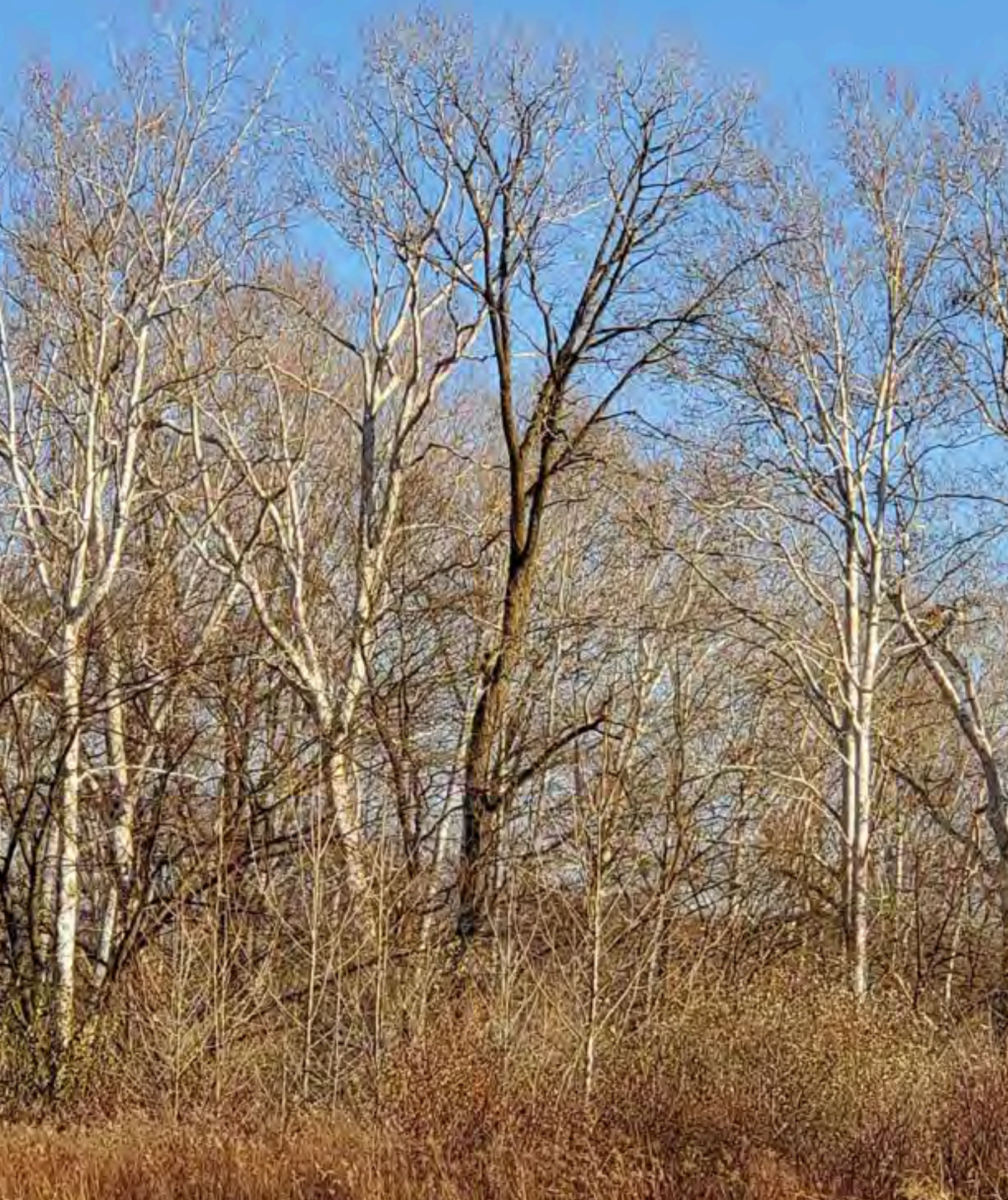
Galbraith I Easement