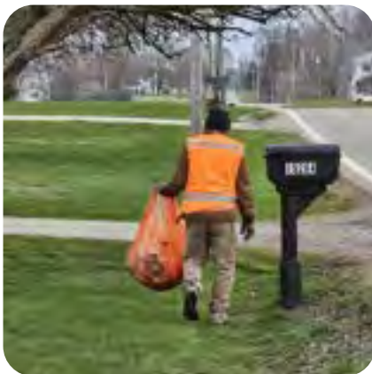
Litter pick-up on SR 95