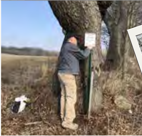
Jeff installing signage

The Owl Creek Conservancy monitoring team physically visits each Protected Property at least once a year to ensure the easement conditions are followed.