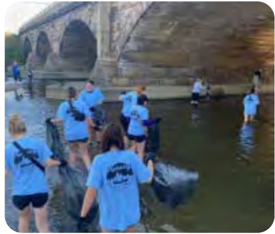
River Rally Event