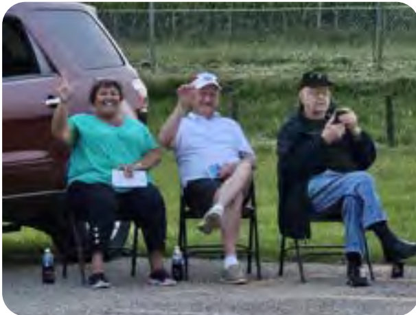
Chimney Swift Event