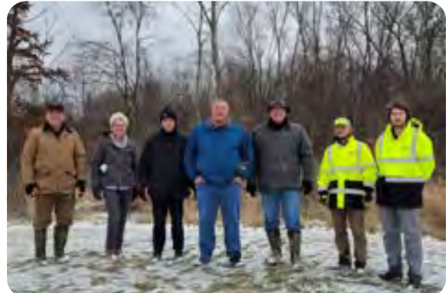
Monitoring the Blackjack Wetland