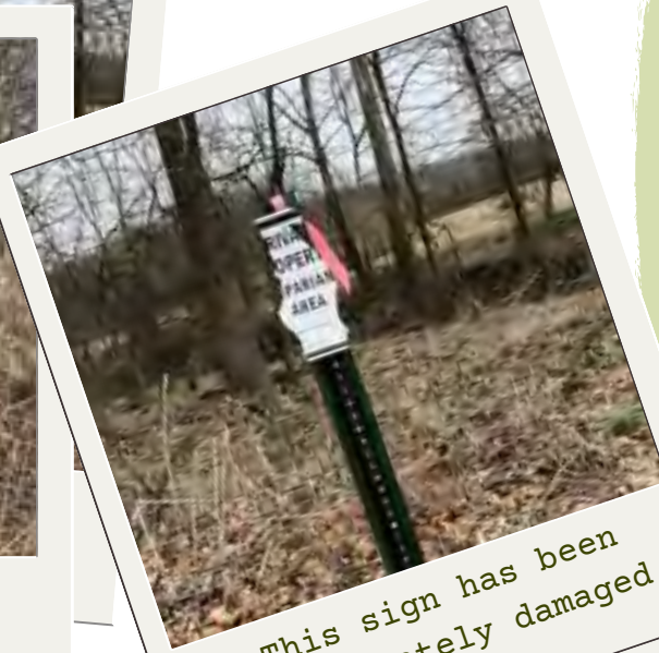
This sign has been deliberately damaged

We also handle the repair and replacement of signs affected by Mother Nature, agricultural machinery, theft, or intentional damage. During our property patrols, we monitor for signs of encroachment, such as trespassing, as well as any incidents of damage, dumping, or other activities that could breach the easement. We then communicate our observations to the Grantor and offer assistance as needed to address any identified violations, including conducting follow-up visits if required.