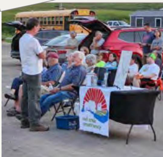
Enjoying the 'Flight of the Chimney Swifts' event

We're constantly working to improve communication within the Owl Creek membership and encourage participation in our events. Through our events, we strive to educate community members about our work and promote conservation.