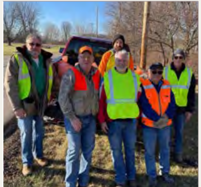
Picking up trash at one of our Adopt-a-Highway events