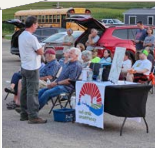
Enjoying the 'Flight of the Chimney Swifts' event

We're constantly working to improve communication within the Owl Creek membership and encourage participation in our events. Through our events, we strive to educate community members about our work and promote conservation.