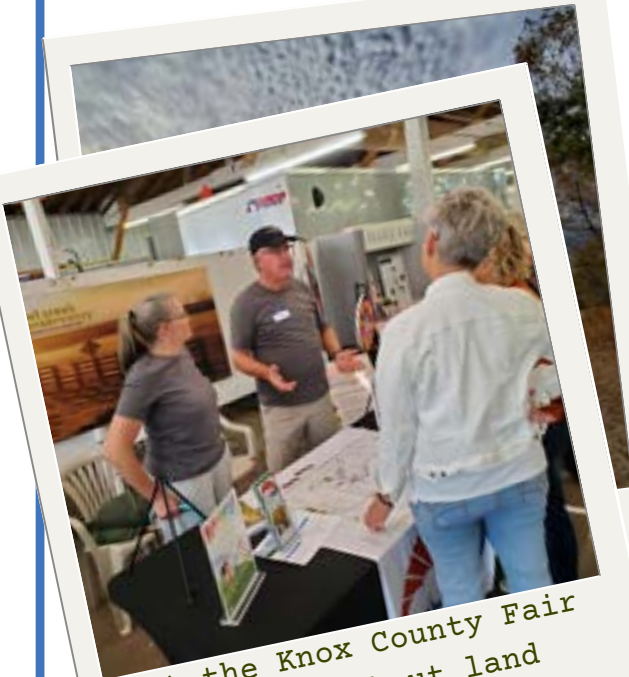
At the Knox County Fair talking about land conservation