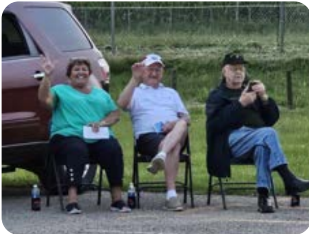
Chimney Swift Event