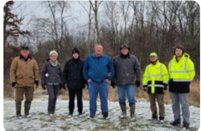
Monitoring the Blackjack Wetland