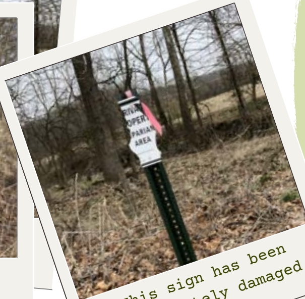
This sign has been deliberately damaged

We also handle the repair and replacement of signs affected by Mother Nature, agricultural machinery, theft, or intentional damage. During our property patrols, we monitor for signs of encroachment, such as trespassing, as well as any incidents of damage, dumping, or other activities that could breach the easement. We then communicate our observations to the Grantor and offer assistance as needed to address any identified violations, including conducting follow-up visits if required.