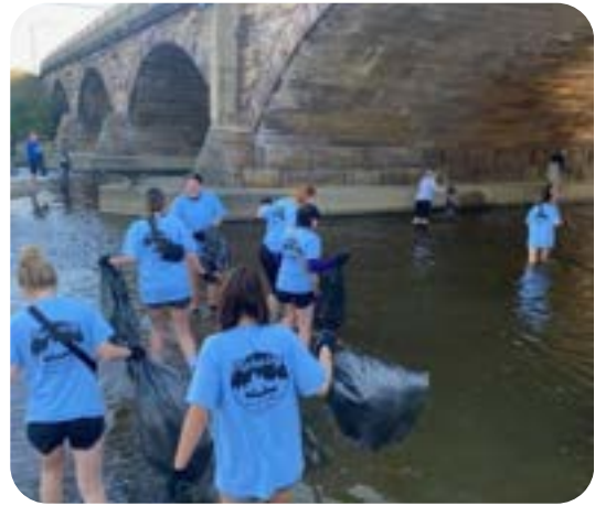
River Rally Event