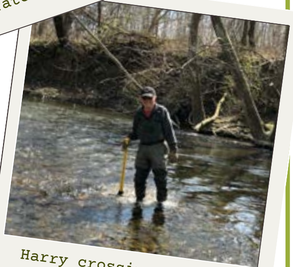
Harry crossing a stream while monitoring

We also handle the repair and replacement of signs affected by Mother Nature, agricultural machinery, theft, or intentional damage. During our property patrols, we monitor for signs of encroachment, such as trespassing, as well as any incidents of damage, dumping, or other activities that could breach the easement. We then communicate our observations to the Grantor and offer assistance as needed to address any identified violations, including conducting follow-up visits if required.