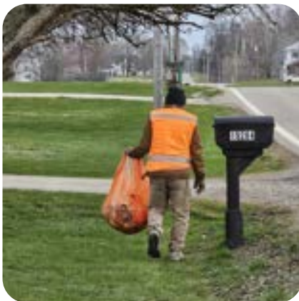
Litter pick-up on SR 95