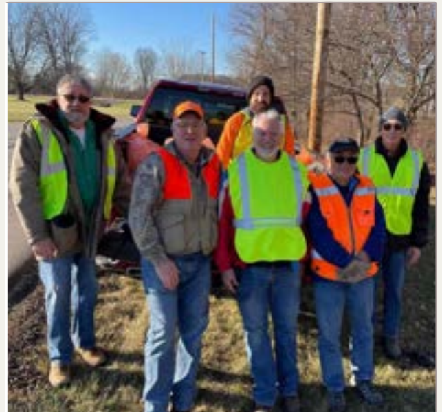
Picking up trash at one of our Adopt-a-Highway events