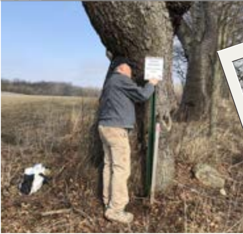
Jeff installing signage

The Owl Creek Conservancy monitoring team physically visits each Protected Property at least once a year to ensure the easement conditions are followed.