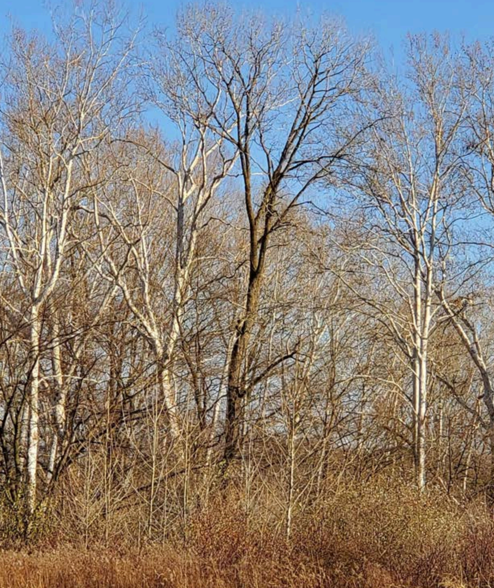
Galbraith I Easement